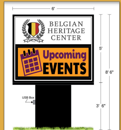
RENDERING OF THE NEW SIGN

The drive-thru Kermis was a big success. We thank everyone who bought food and merchandise, donated their time or made an in-kind donation. There was no band or beer, but it sure was great to see everyone at the drive-thru. We greatly appreciate the tremendous support of the community which allows us to preserve our Belgian heritage for future generations. We hope you enjoyed the "virtual Kermis" offerings on Facebook and the website too.